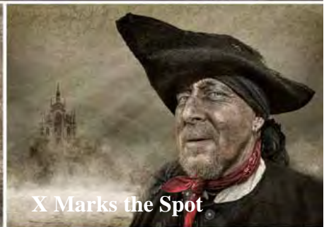
X Marks the Spot