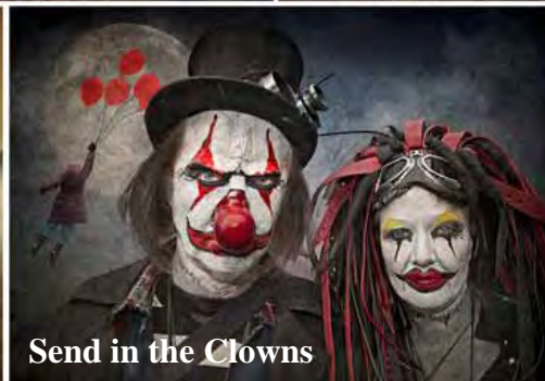
Send in the Clowns